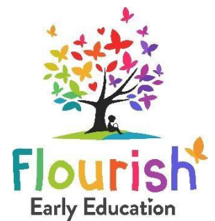
Flourish Early Education