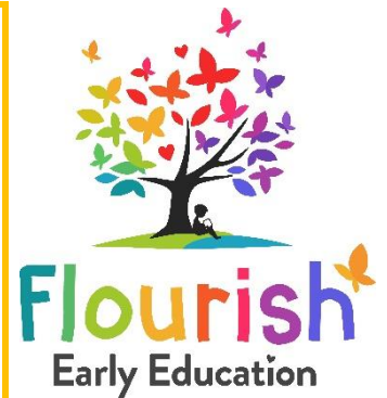
Flourish Early Education